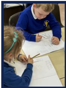
Year 2 pupils learning about eminent women in science.