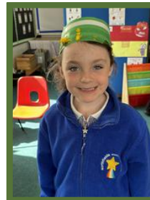
Pupils in Year 1 learnt about trees and plants and created some beautiful crowns decorated with wild flowers.